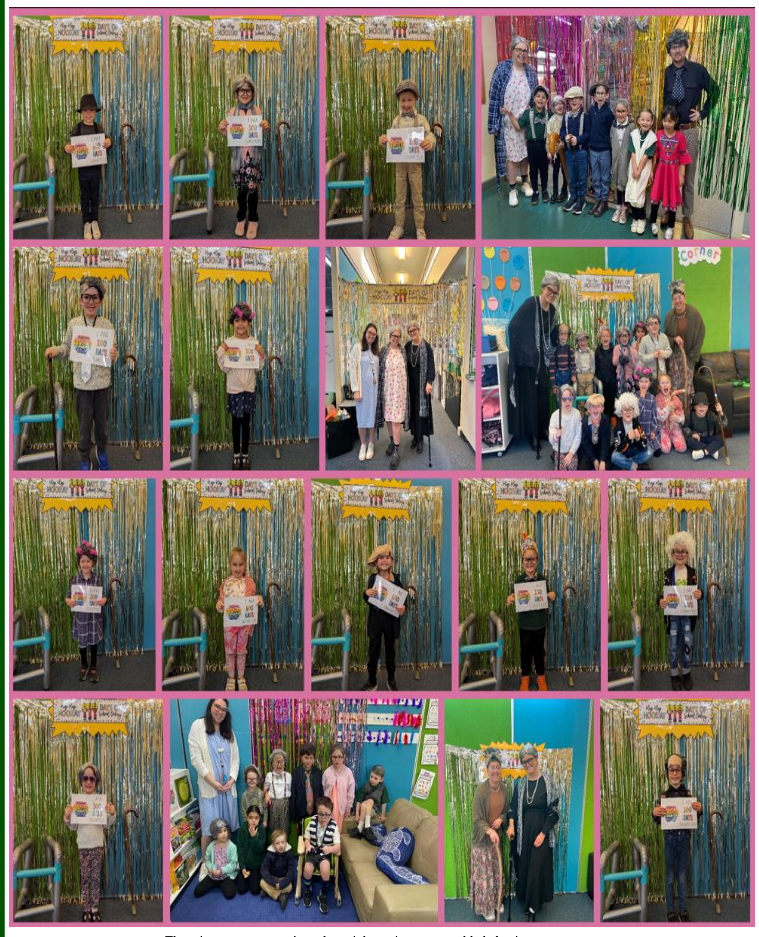
There is never an occasion when violence is an acceptable behaviour.